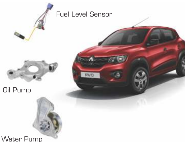
Fuel Level Sensor